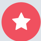
High Quality ECE

In short, running a viable high-quality ECE business is hard. The challenges of balancing cost and quality put small, independent providers at a significant disadvantage.